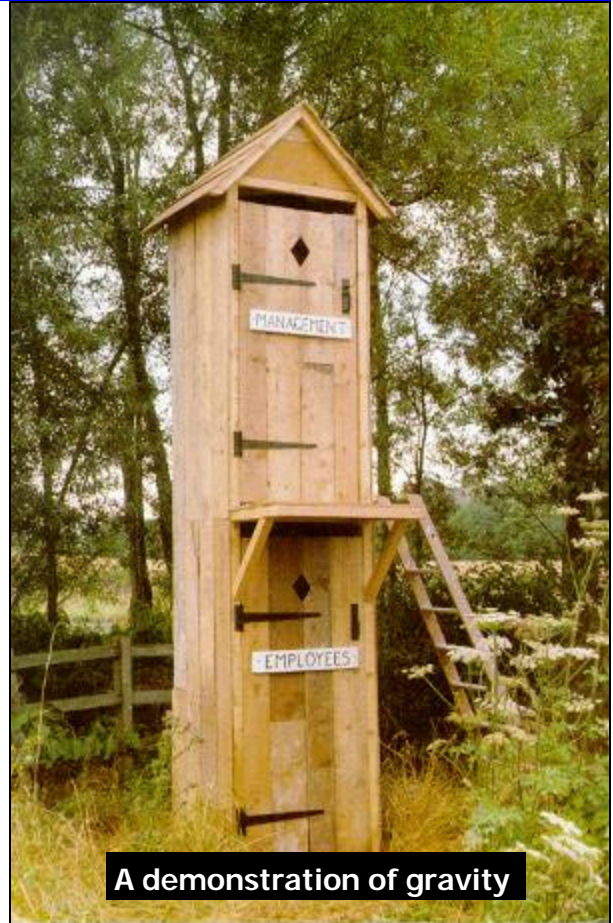
A demonstration of gravity