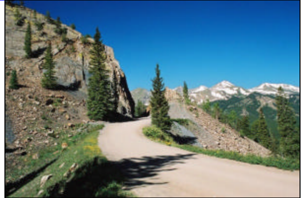
above: Boreas Pass

Hello, Procurement? There appears to have been a mix up with my request for a new computer.